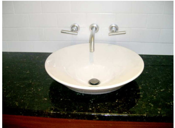
KOHLER Vessel Sink