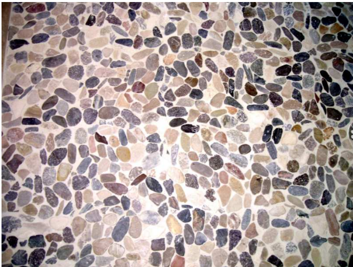
Natural Stone pebble shower floor