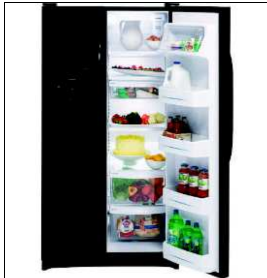
GE Appliances, GE Energy Star Refrigerator