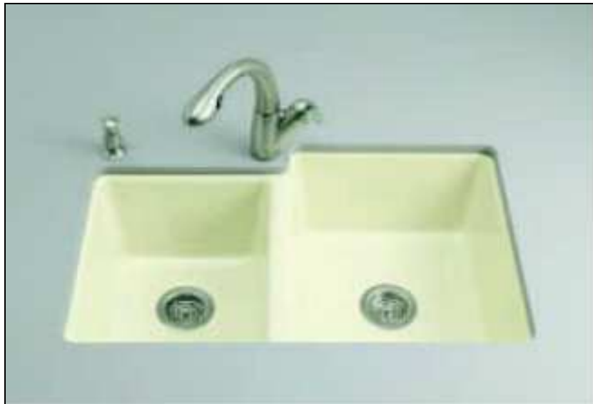
KOHLER clarity counter sink in Sand Bar finish Item# K-5814-4U