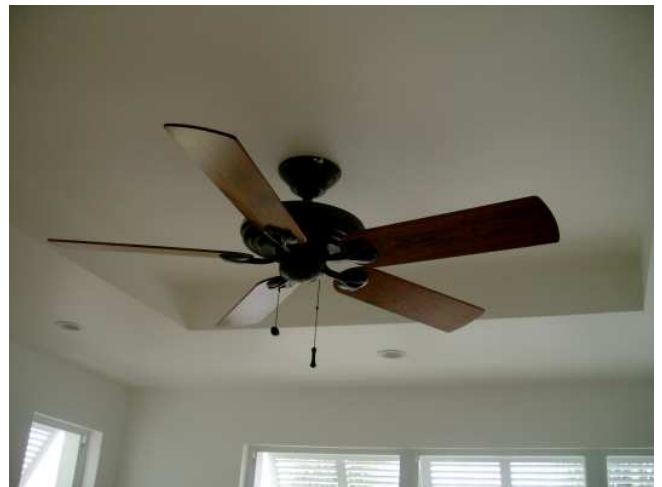
Fans throughout the unit