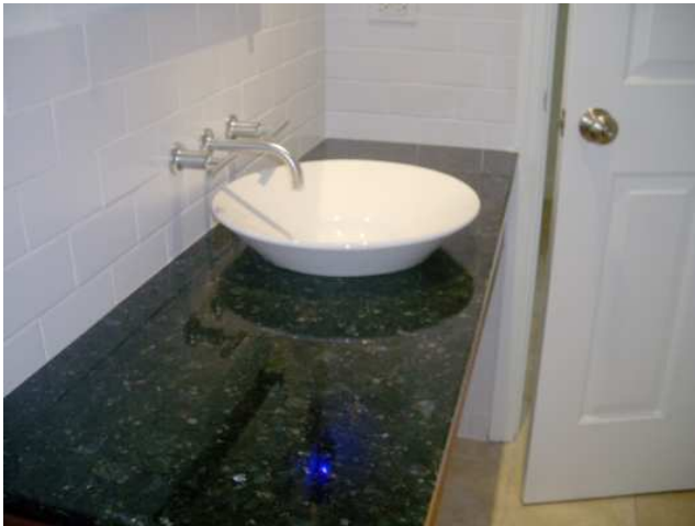
Black Granite counter top