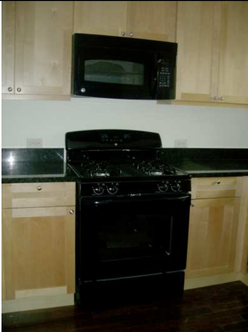
GE Gas Range and Microwave