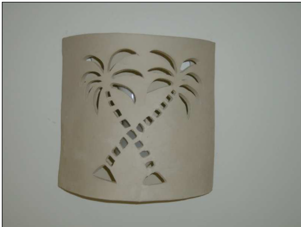
Interior wall sconce locally made and especially designed for Nanny Cay Village by Bamboushay Pottery