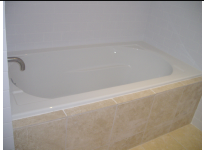
Drop-in Devon shire KOHLER Bath tub