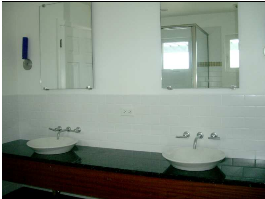
Double vanity in third floor unit