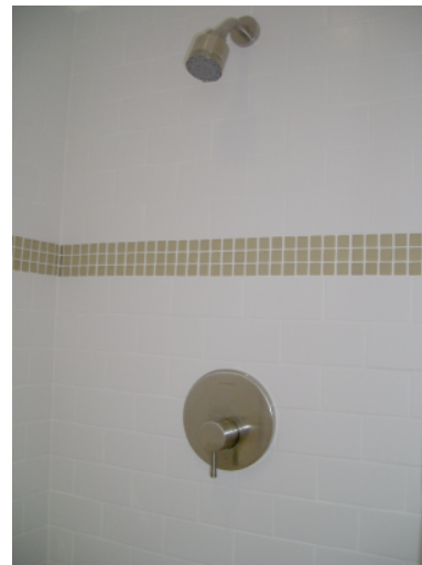
American Standard Shower Kit, White subway tiles with Marcas Glass border