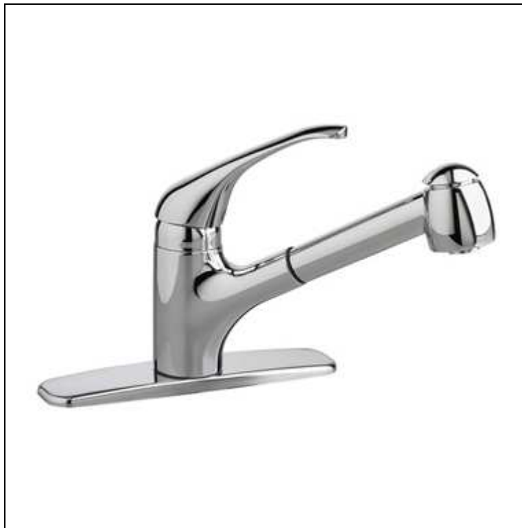
American Standard Reliant & Kitchen Combination Faucet with spray adaptor in Satin Nickel. Item# 4025.100