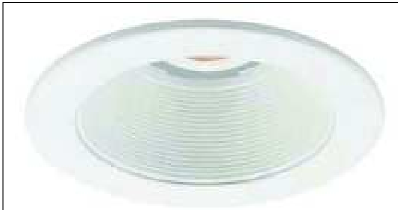
Recessed 4" white baffle trim light Item #R4.493B