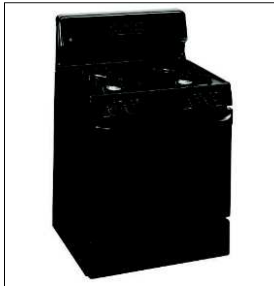
GE Appliances, 30" Freestanding Gas Range in Black.