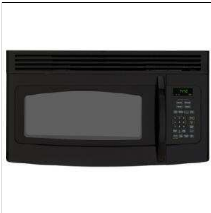
GE Spacemaker 1.5 Cu. Ft. Over the range Microwave with extractor fan in black. Item #JVM1540DMBB