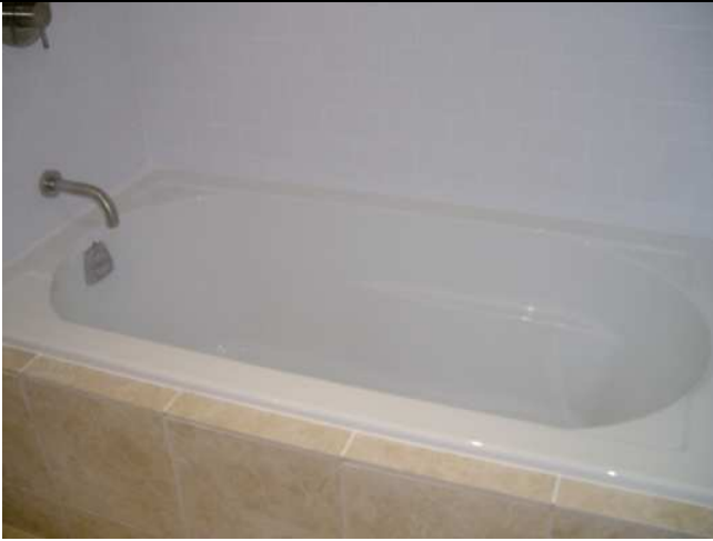
Drop-in Devon shire KOHLER Bath tub