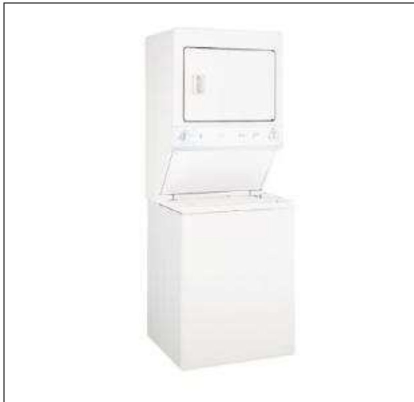
GE Spacemaker Washer and Electric Dryer. White on White. Item # WSM2700HWW