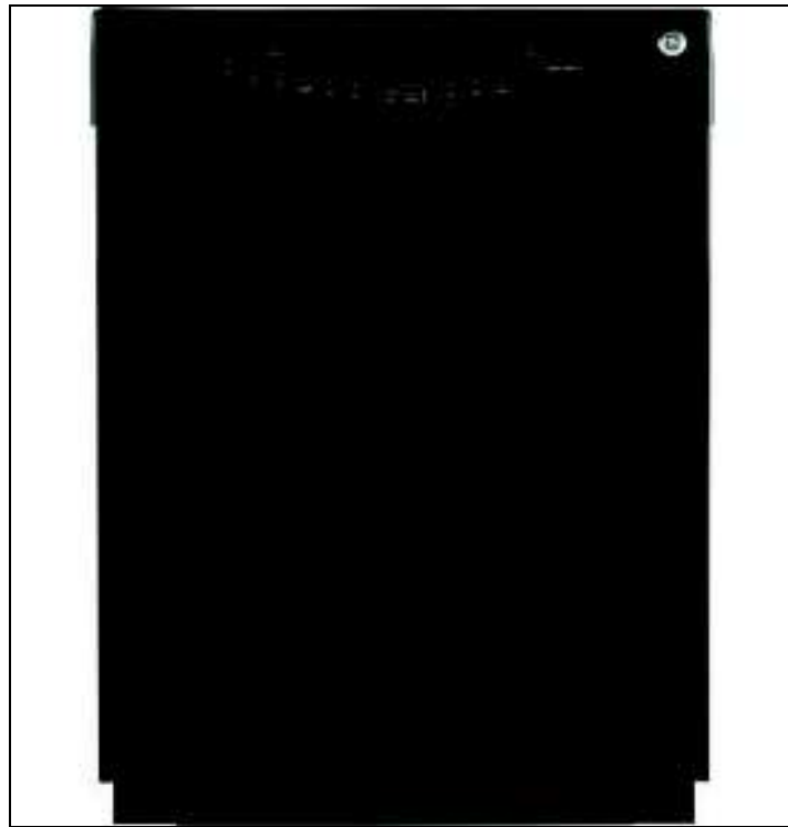
GE Appliances- Tall Built-in Dishwasher in Black. Item # GLD5800LBB