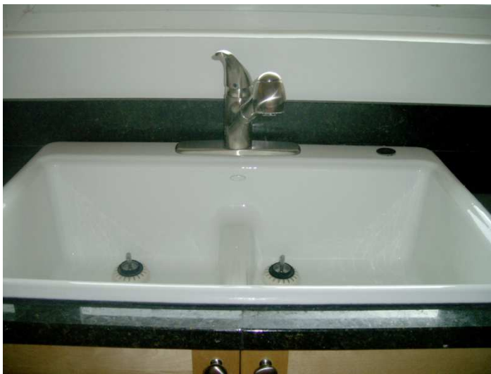
KOHLER double sink with an American Standard COMBI - faucet