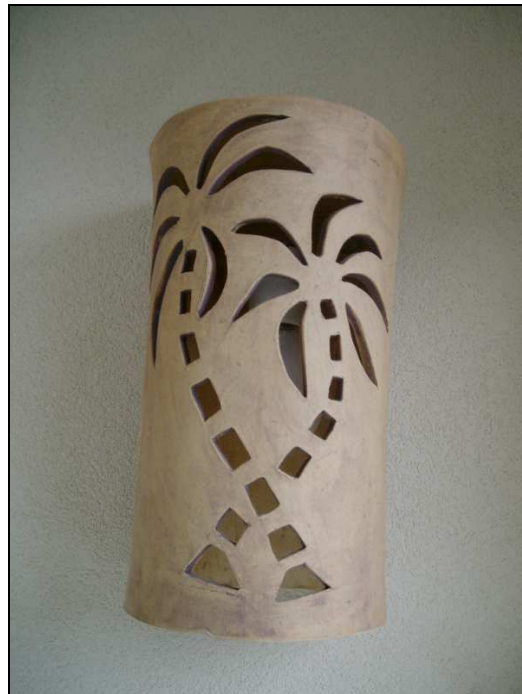
Exterior wall sconce locally made and especially designed for Nanny Cay Village by Bamboushay Pottery