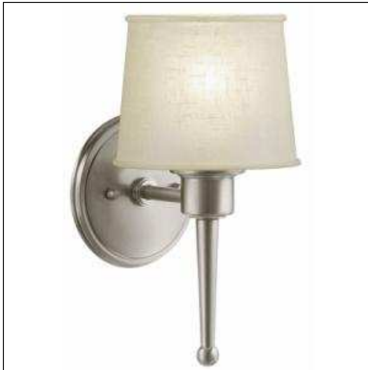
Hampton Bay Architect Collection- Brushed Nickel Finish Bathroom Light. Model # HB472280D