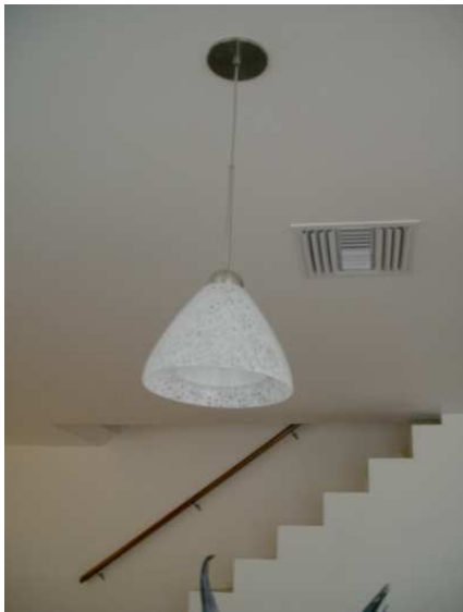
Dining Room Light