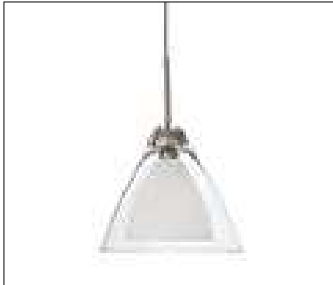
Dome SI Grande Tetra

Cased opal glass enclosed in mouth blown Murano Glass. Imbued with layers of murrines in opal with satin nickel finish.