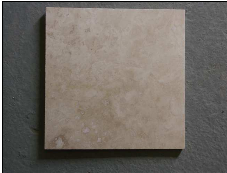
12" X 12 Ivory light hone finished floor tile.