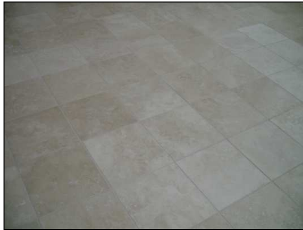
Ivory Honed 12" X 12" tiles