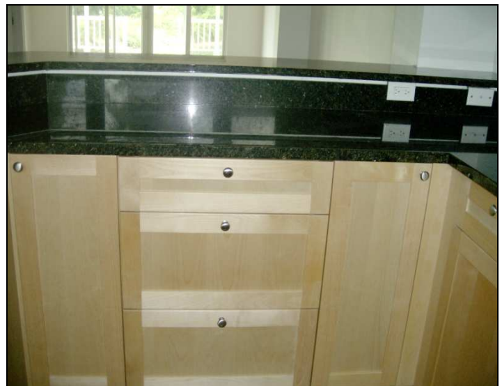
Custom built cabinets and granite countertops